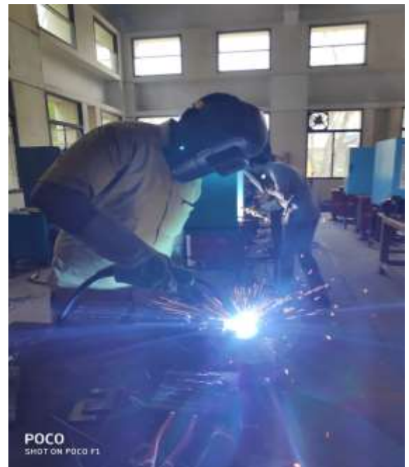
Hands-on training on Welding