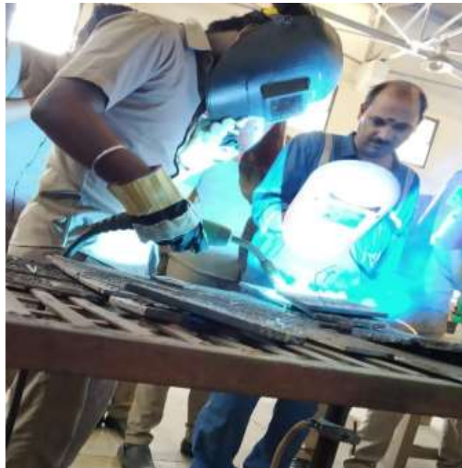
Our Students performing Arc Welding

First day training session covering the Arc welding basic theory and applications. These technical lectures and laboratory classes were handled by the senior faculty members from Sri Venkateswara College of Engineering.